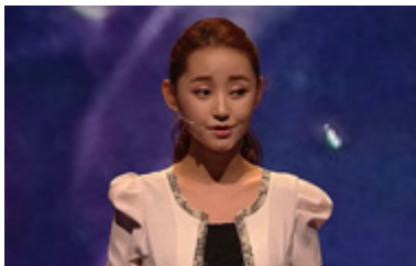
Yeonmi Park Breaking the Myth of North Korea