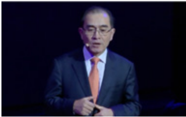
Thae Yong-ho Inside the Kim Regime