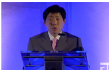
Park Sang Hak North Korea's Freedom Fighters