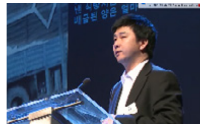
Kang Chol-hwan Ten Years in North Korea's Gulags