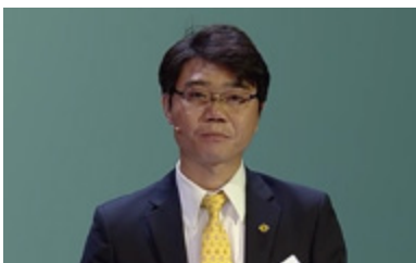
Ji Seong-ho My Impossible Escape from North Korea